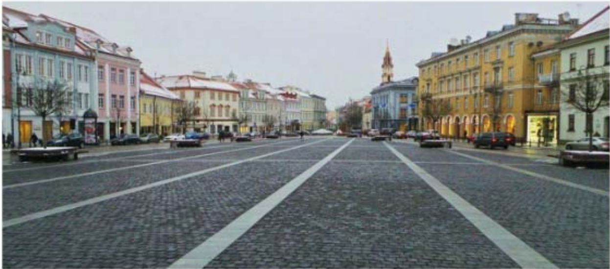
The Town Hall Square, Vilnius

The Town Hall Square, is a must visit with its impressive Town Hall. Ausros Vartu Street has many attractions like St Casimir's Church, the National Philomonic Hall, Basilian Gates, the churches of Holy Trinity, Holy Spirit and St Teresa. Gediminas Avenue is for shopping, but there are places to stop and rest a while before you continue to shop!