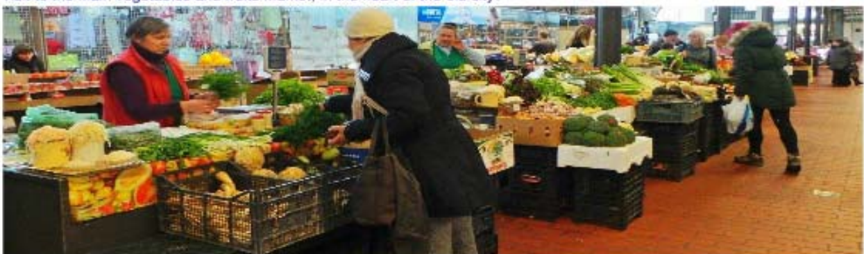
The central market, Vilnius

Once the business day is over or for networking opportunities, Vilnius has developed a wide variety of options: Hot Air Ballooning – glide over the Old Town in a hot air balloon. Vilnius is the only European capital that allows hot air ballooning over the city centre! Canoeing River Neris & Canoe Polo. A Medieval Feast in Trakai Castle with a private view of the museum. Cepelinai Cooking Classes – a great team-building event to learn about Lithuanian cuisine and traditions, with a visit to the main vegetables and fruits market, in the heart of the old city.