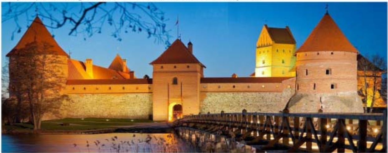
The Trakai Castle, Vilnius

Vilnius University is one of the oldest universities in Eastern and Central Europe. Established in 1579 it is one of the few universities in Europe which has preserved its original purpose of the old buildings. The spectacular chambers and courtyards provide an original location for conferences and seminars of many kinds.