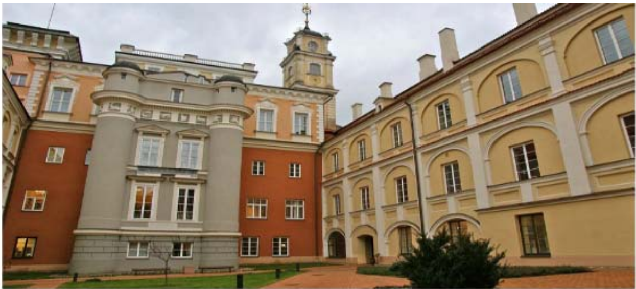
The Vilnius University

Vilnius University is one of the oldest universities in Eastern and Central Europe. Established in 1579 it is one of the few universities in Europe which has preserved its original purpose of the old buildings. The spectacular chambers and courtyards provide an original location for conferences and seminars of many kinds.