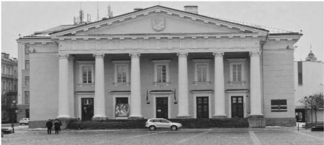
The Town Hall, Vilnius

The Town Hall Square, is a must visit with its impressive Town Hall. Ausros Vartu Street has many attractions like St Casimir's Church, the National Philomonic Hall, Basilian Gates, the churches of Holy Trinity, Holy Spirit and St Teresa. Gediminas Avenue is for shopping, but there are places to stop and rest a while before you continue to shop!