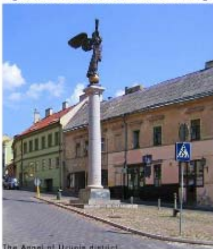
The Angel of Uzupis district

Uzupis is a Republic within the city of Vilnius itself. Formed by artists it has its own Constitution, President and Bishop, plus a guardian; the statue of the Bronze Angel of Uzupis. Here you will find bridges, bars, restaurants, art and craft shops.