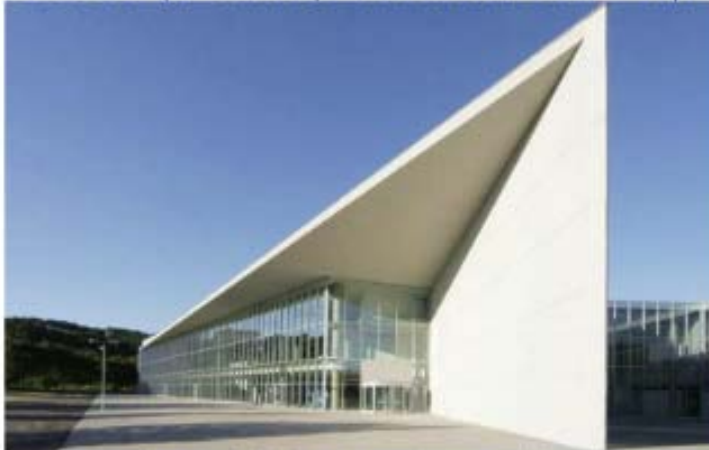
Lithuanian Exhibition and Convention Centre, Vilnius

M.I.C.E business in Lithuania means being the best and offering the best. The city offers a 1st class business environment that is becoming internationally recognised. There is a diverse choice of hotels, modern and the most up-to-date conference halls as well as unique venues, including ancient mansions, castle halls, rebuilt royal palaces, modern glass towers, big arenas and large open-air squares all on offer to accommodate any meeting or event. Venues and conference centres pride themselves on qualified and experienced staff so all events will be perfect.