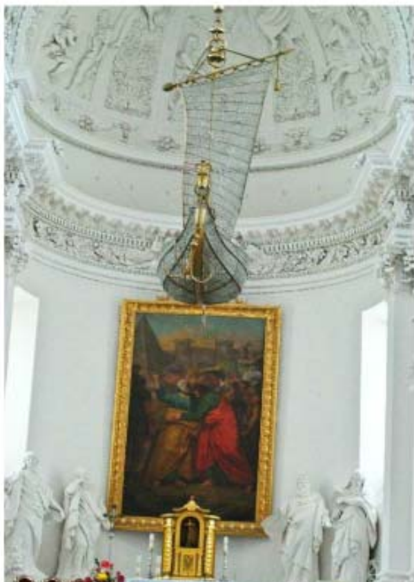
St. Peter's and St. Paul Church, Vilnius

During Jan-Sept 2015, 753,387 guests stayed in Vilnius with a total of 1,409,453 nights, representing a 6% and 4.5% rise respectively on 2014 figures. 83% of guests were foreigners, most coming from Belarus, Germany, Poland, Russia and Latvia – accounting for 48.3% of all foreign guests. The highest growth in tourists was from Japan up 71.7% compared to the same period in 2014. The number of tourists from other Asian countries increased too with Chinese tourists up by 28.6%, while from Israel, +26% and South Korea up 9%.