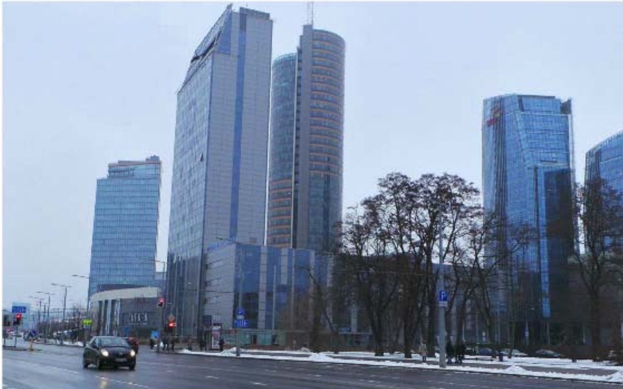
Europa square, Vilnius

fastest internet in the world. Industry sectors like technology, banking, manufacturing, retail and the services are all growing. The biggest growth is in m.i.c.e. When Vilnius opened its arms to the world to come and do business, the world responded with huge success! One such example is one of the biggest annual events currently in the Baltic Sea Region; Convene, which just concluded last month. The new European looking business sector of Vilnius is a bustling area and a wonderful contrast to the Old Town.