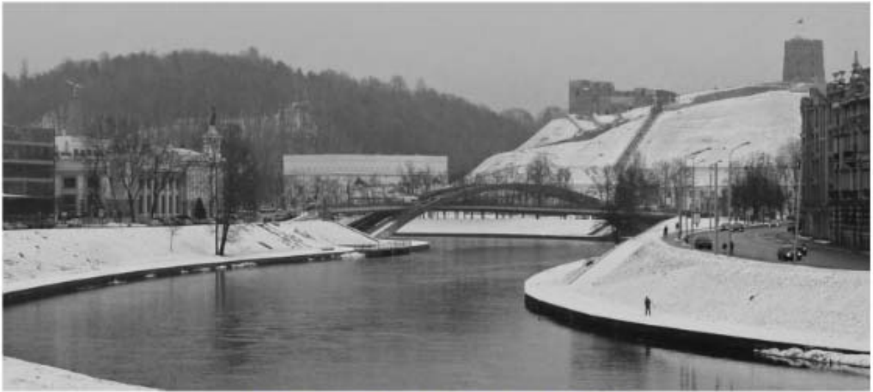
Gediminas tower at the upper castle and the Neris River, Vilnius