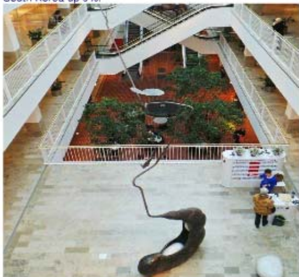
Shopping mall at Gediminas avenue, Vilnius

During Jan-Sept 2015, 753,387 guests stayed in Vilnius with a total of 1,409,453 nights, representing a 6% and 4.5% rise respectively on 2014 figures. 83% of guests were foreigners, most coming from Belarus, Germany, Poland, Russia and Latvia – accounting for 48.3% of all foreign guests. The highest growth in tourists was from Japan up 71.7% compared to the same period in 2014. The number of tourists from other Asian countries increased too with Chinese tourists up by 28.6%, while from Israel, +26% and South Korea up 9%.