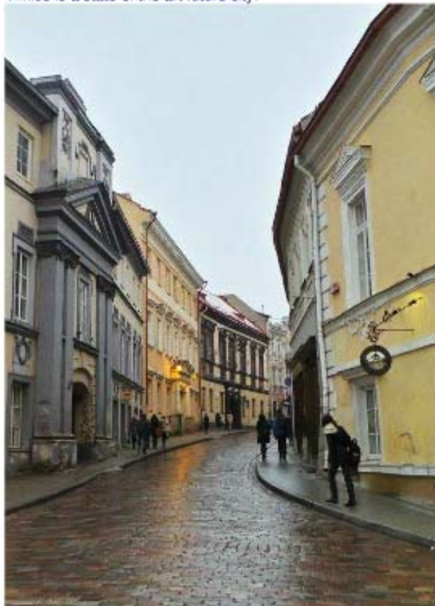
Dominikonu street, old town

It is the 2nd biggest city in the Baltic States and the most beautiful baroque capital in the European Union! With 46% of the city area covered by green open spaces, it is no surprise that Vilnius is a 'green city', with the cleanest air in Europe and high quality of drinking water. Added to that its highly developed cycles lanes and bicycle hire options, the city of Vilnius is a state of the art future city.